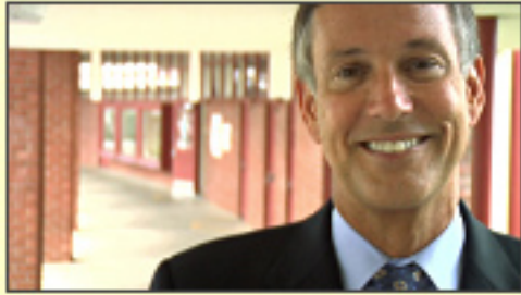
Former California State Superintendent