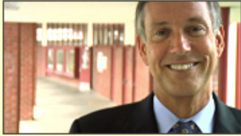
Former California State Superintendent