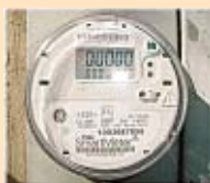
A PG&E Smart Meter.