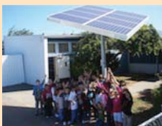
Students erect a solar panel in the PG&E Solar Schools initiative.