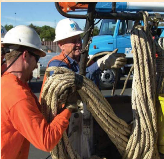
Above: PG&E employees stow rope and tools aboard a truck as they prepare to leave for Florida to restore power in September 2004.